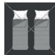
OPTIONAL GROUND TENT WHERE AVAILABLE