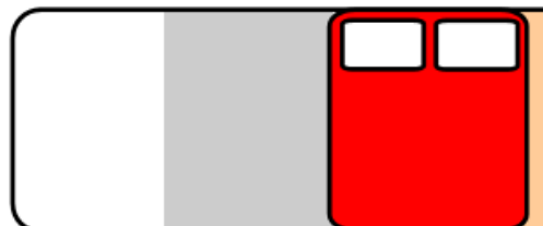
Toyota Hilux Double Cab