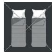
OPTIONAL GROUND TENT WHERE AVAILABLE