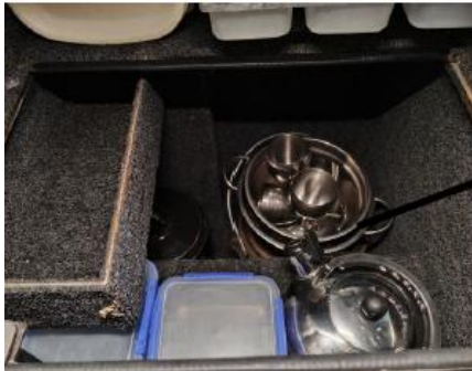
Cutlery and cooking utensils