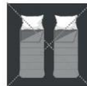
OPTIONAL GROUND TENT WHERE AVAILABLE